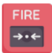
Fire detection and alarm system

Information available to residents routinely online are planned maintenance/repairs schedules and outcomes for: