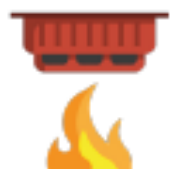
Fire smoke dampers