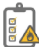
Fire Risk Assessments