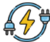
Fixed electrical installations