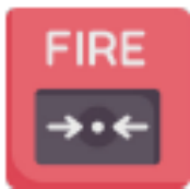
Fire detection and alarm system

Information available to residents routinely online are planned maintenance/repairs schedules and outcomes for: