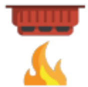
Fire smoke dampers